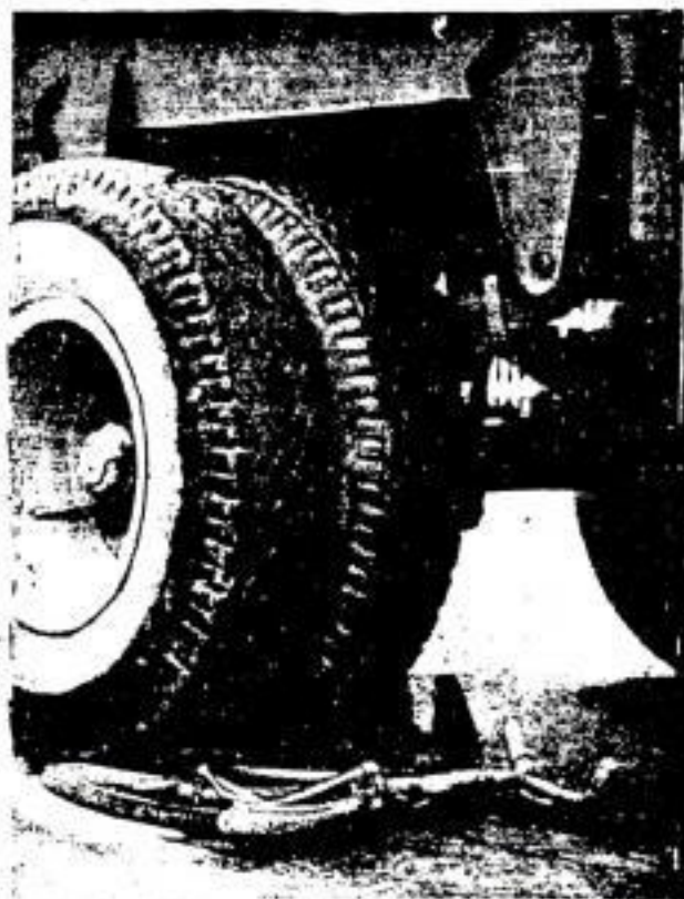
Symbol des Schreckens: Ein Kinderfahrrad liegt zermalmt unter dem Zwillingstyre eines Lastwagens. Bei diesem Unfall starb ein neunjähriger Bub.