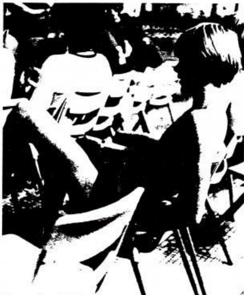
Not a scene from the IPCE conference