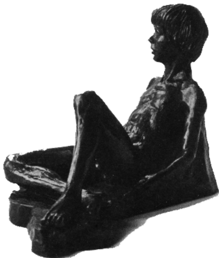
BOY RECLINING Height 15cm - £30.